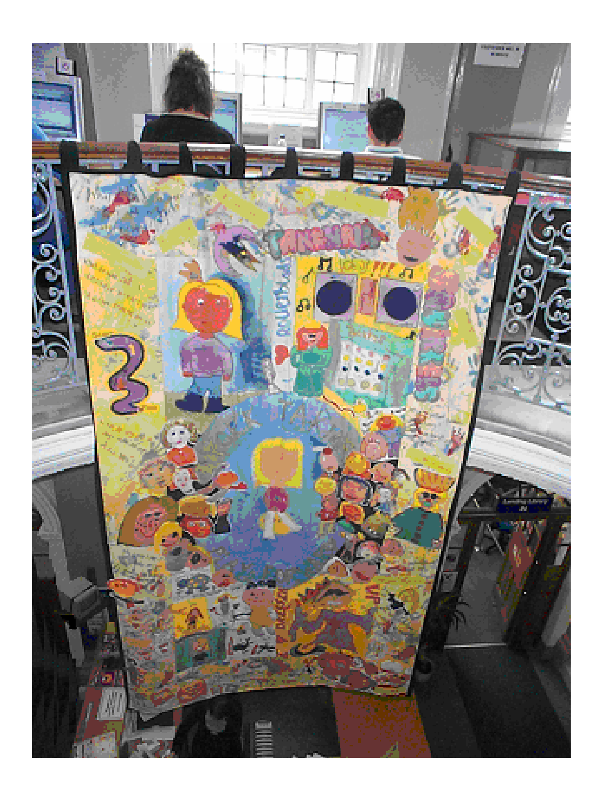
Taking Play Forward - a policy for Play in the City of York