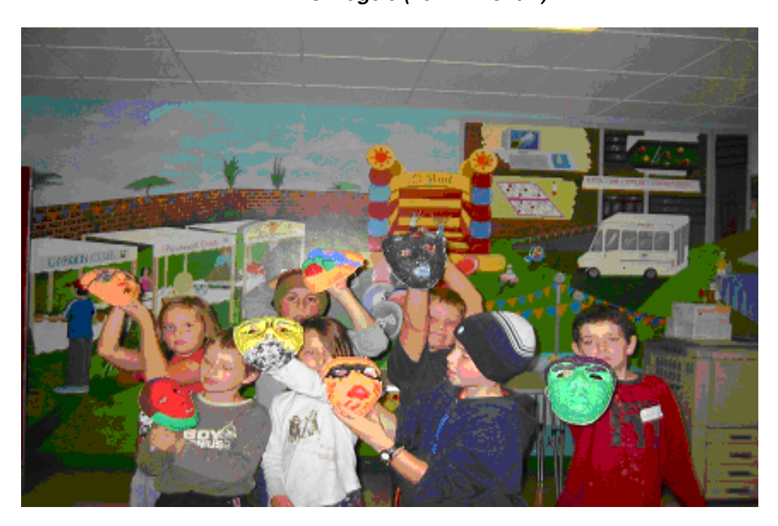
"Play is a thing where you can roam free and do what you want" - Anon girl from York age 9 (10 in 1month!)